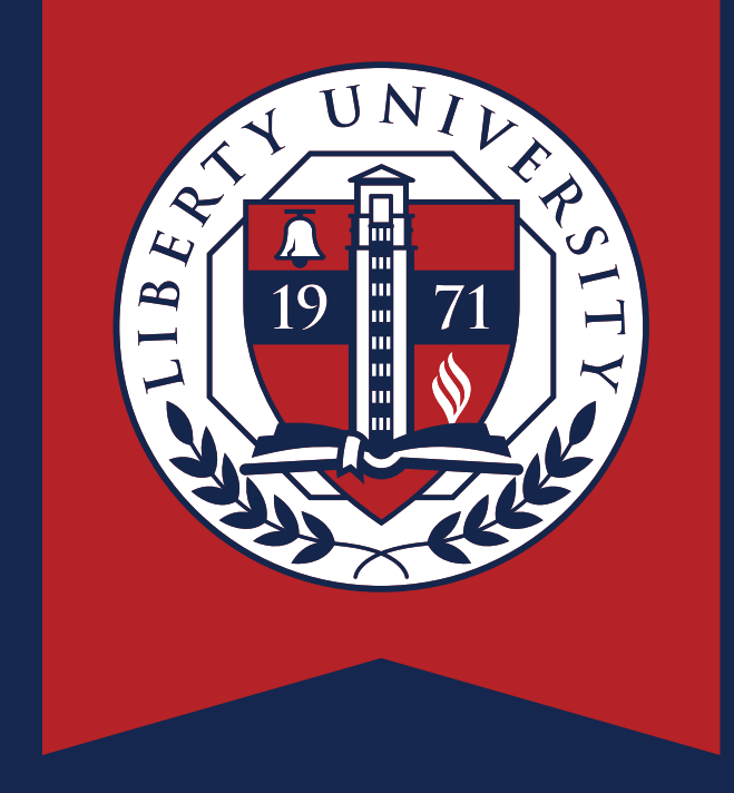
Image: Second systemImage: Liberty universityImage: Second systemCommencementImage: Second systemCommencement