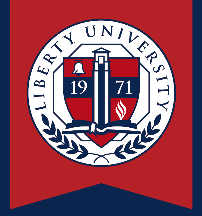
Image: Second systemImage: Liberty universityCommencementCommencement