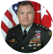
Gen. Keith Kellogg (Ret.) Fmr. National Security Advisor to White House