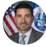
Chad Wolf Fmr. U.S. Secretary of Homeland Security