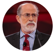
Frank Gaffney Fmr. National Security Adviser