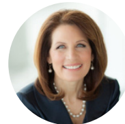
Michele Bachmann Fmr. U.S. Representative & Government Dean, Regent University