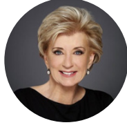
Linda McMahon Fmr. SBA Administrator