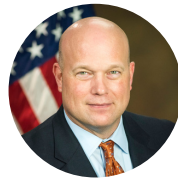
Matthew Whitaker Fmr. U.S. Attorney General