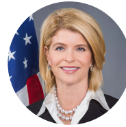
Amb. Carla Sands (Ret.) Vice Chair, Center for Energy & Environment, America First Policy Institute