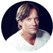
Kevin Sorbo Executive Producer & Director