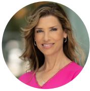
Sam Sorbo Producer & Actress