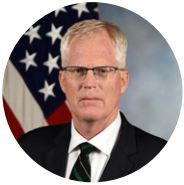
Christopher Miller Fmr. U.S. Secretary of Defense