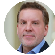
William L. Sparks Chair & Prof. of Leadership & Best-Selling Author