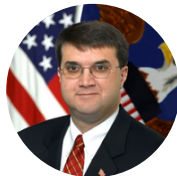
Robert Wilkie Fmr. U.S. Secretary of Veteran Affairs