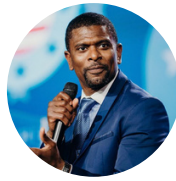
Jack Brewer U.S. Commissioner on the Social Status of Black Men and Boys