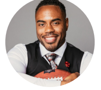
Rashad Jennings NFL Star & Winner of Dancing with the Stars