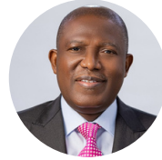
Olukayode Pitan CEO, Bank of Industry (BOI)